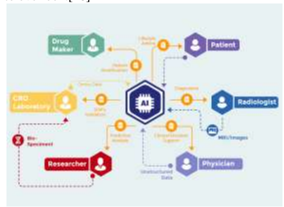
Fig.No.4 Future of Ai

For organizations that haven't yet put resources into the innovation, the message is clear: AI is as of now assisting your rivals with accomplishing astonishing things, direct less preliminaries, and grow new medications quicker. On the off chance that you need to stay up with them – both now and later on – it's an innovation you basically can't bear to overlook.[18]