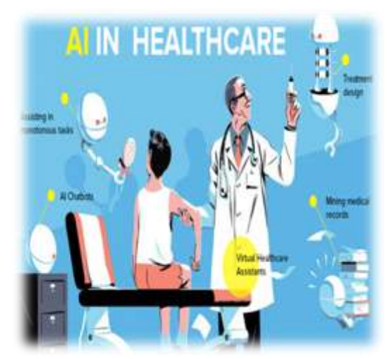
Fig no .2 Ai in healthcare

Volume 6, Issue 1 Jan-Feb 2021, pp: 146-157 www.ijprajournal.com ISSN: 2249-7781